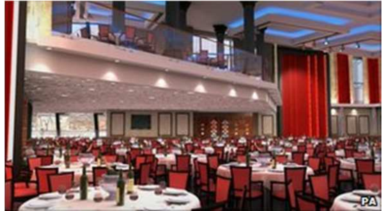
This suite is a replica of Titanic's first-class banqueting room

The Titanic Suite of Belfast's new £97m visitor attraction dedicated to the doomed liner has started taking bookings ahead of its opening next year. The visitor attraction, which is due to open in eight months, is in the same spot where the famous ship was built by Harland and Wolff 100 years ago. From its windows visitors will look down on the drawing office, the dry dock and the slipway, while the scale of the building will mimic the actual size of the ship.